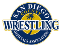
SDCWOA Organizational Structure

- Further discussion Board direction regarding Ranking/Post Season selection Committee and Election Committee. It was agreed that these committees should include Members beyond the Board, and their focus should be on creating, documenting, administering the relative processes.